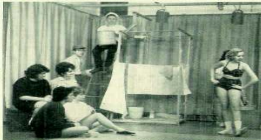
"YOUTH SPEAKS" ... dances and sings songs from South Pacific. Other cultural activities are slated for the week.